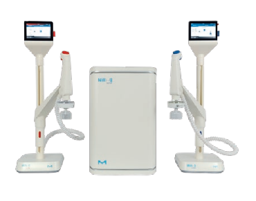
Milli-Q® IQ 7 series water purification system Delivers consistently high-quality ultrapure water

IPAK Quanta® ICP polishing cartridge Removes trace ions