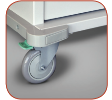
5" Tracking Wheel