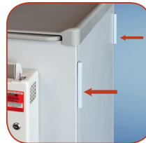
Chair Rail Bumpers