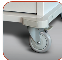
5" Braking Wheel