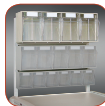
Tilt Bin Organizer