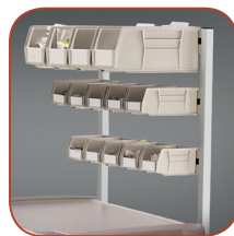
Bulk Storage Bins